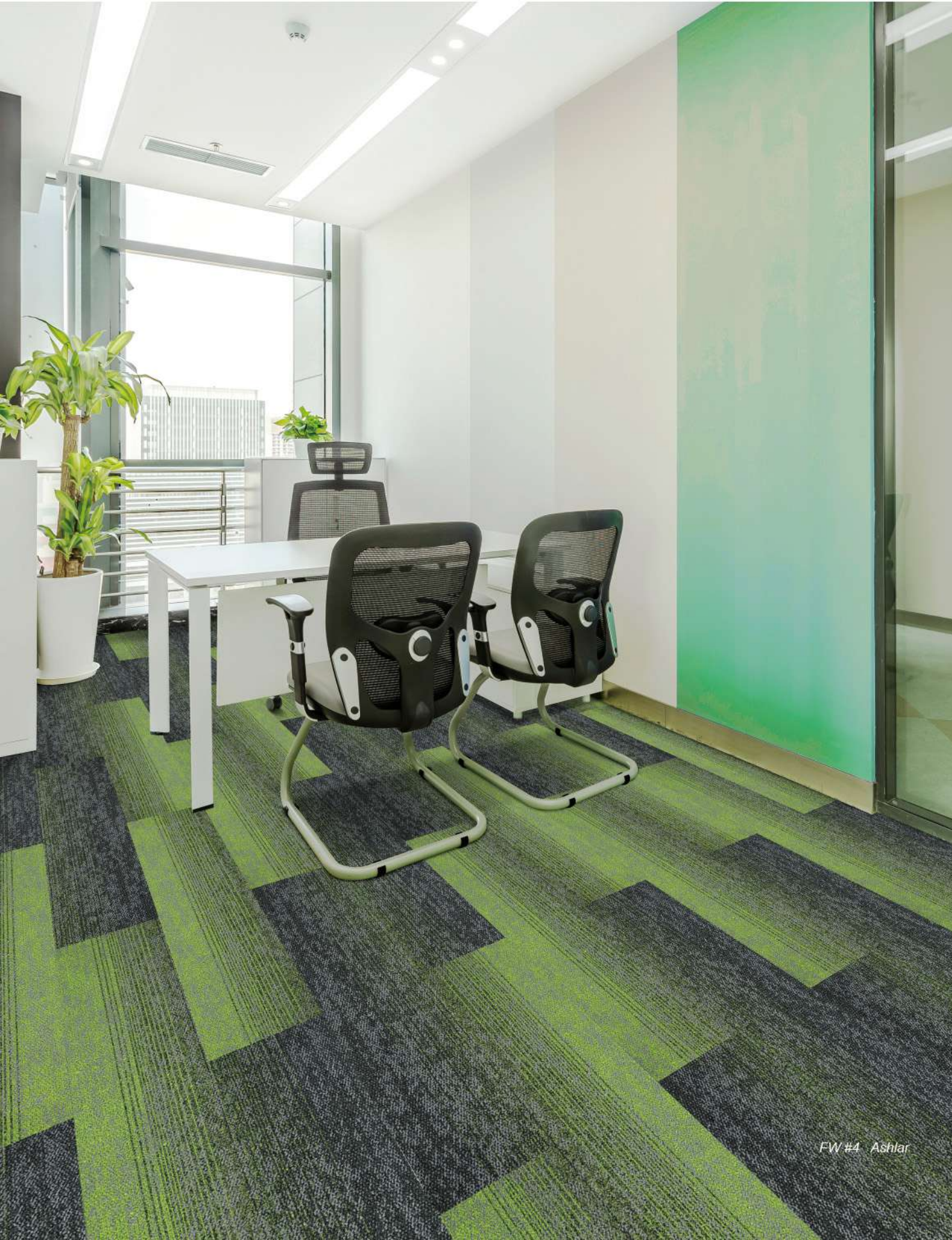
FW #4 Ashlar