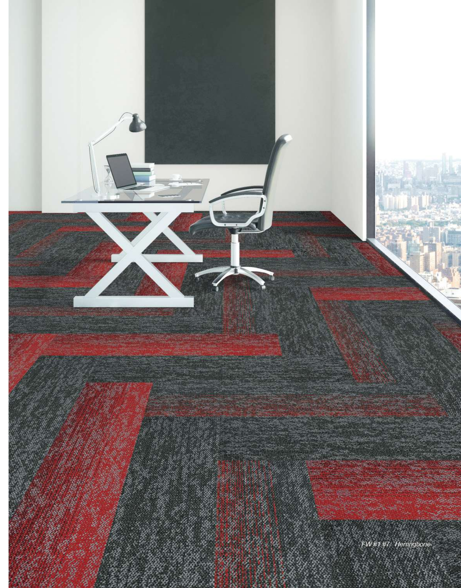
FW #1 #7 Herringbone

5 years limited warranty: No more than 10% face yarn loss by weight under normal use. Limited static warranty. Limited delamination warranty under normal use.